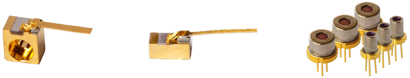
1940 nm: 1.5mm Cavity Length 150um Aperture